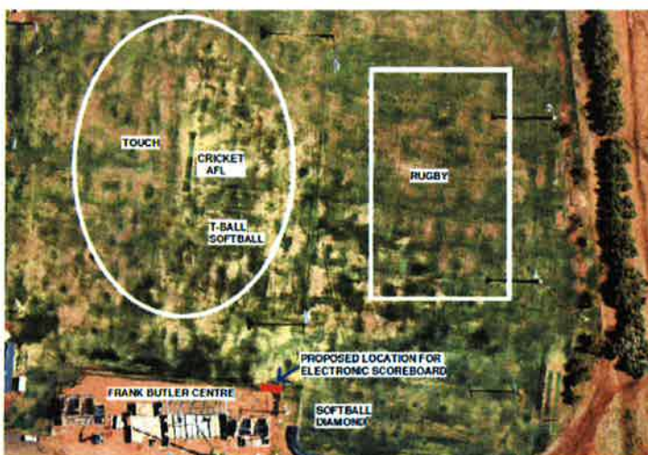
Suggested Location at Bulgarra Oval

The Falcons Football club feel that as the scoreboard is a city asset and would be installed on a city oval for the benefit of all city user groups that pay for use of the oval facilities that it should be for the City to install. Volunteer user groups are not set up to install infrastructure and it opens up all sorts of liability issues such as safety and insurance.